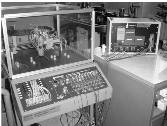
Fig. 1. PLC and robotic manipulator.

Traditionally, a manipulator is connected to a PLC via digital I/O or specific hardware interfaces. In this case, the manipulator and PLC programs can only communicate at a very low level (Popescu, 2001).